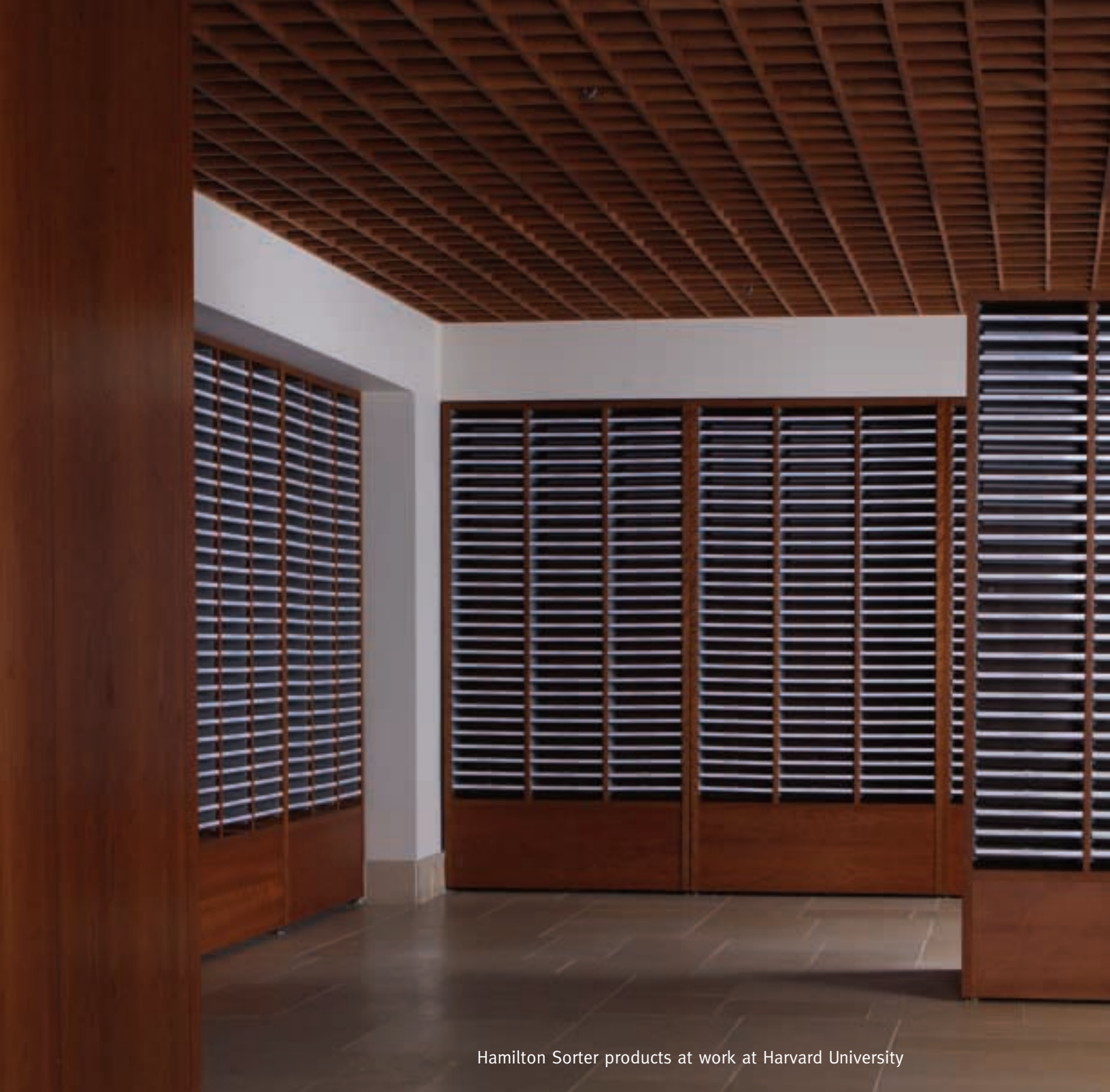
Hamilton Sorter products at work at Harvard University